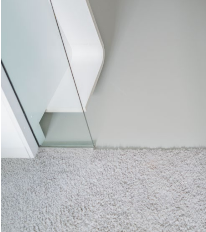
Colour-coordinated flooring in harmony with the overall design concept.