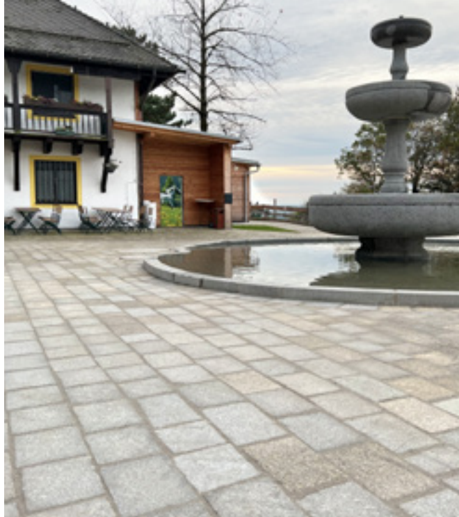
A well-kept appearance combined with a mechanically resilient surface.