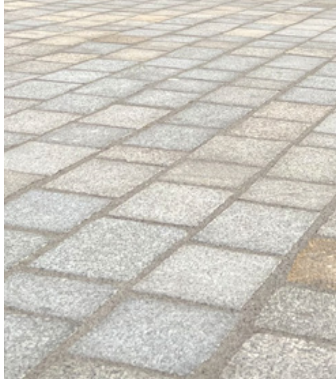
The drainable joint mortar prevents weed growth.