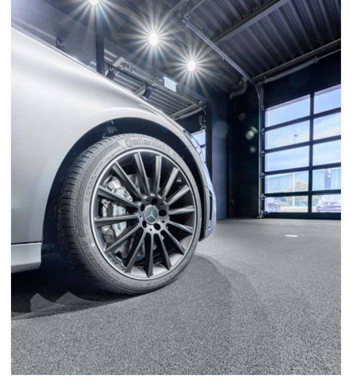
Impressive presentation space with sales-promoting effect.