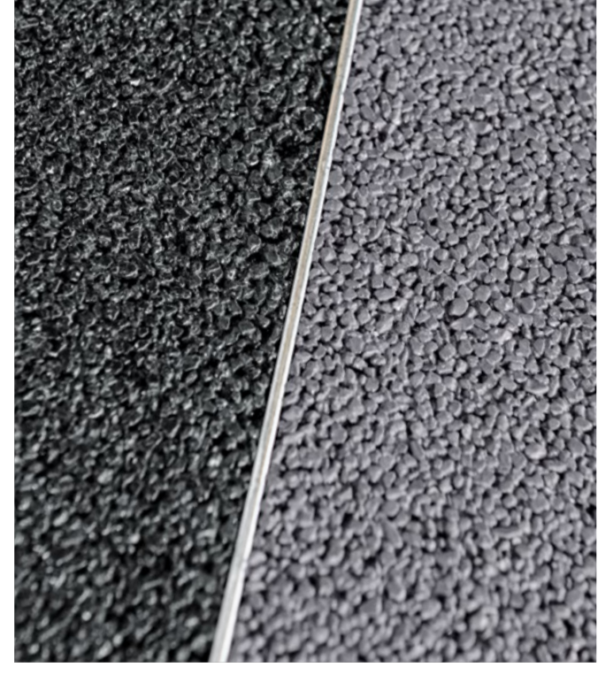
Visual demarcation with coloured quartz pebbles and stainless steel rails.