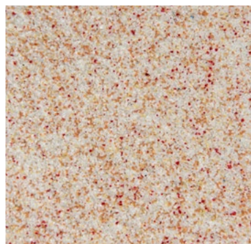
CQS-4606 | 0,3/0,8 mm Base* white CQS-4656 | 0,7/1,2 mm