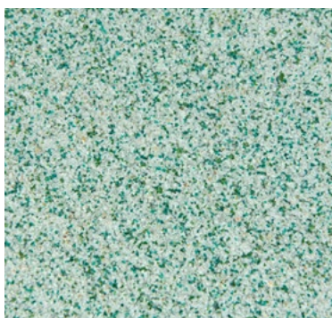
CQS-4607 | 0,3/0,8 mm Base* light grey CQS-4657 | 0,7/1,2 mm