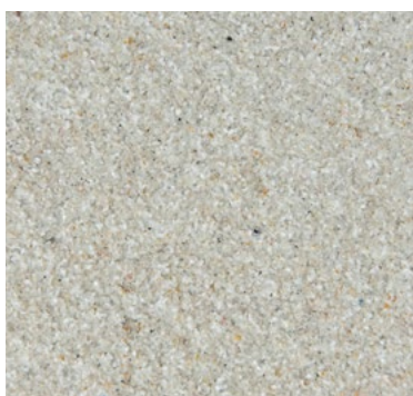
CQS-4601 | 0,3/0,8 mm Base* white CQS-4651 | 0,7/1,2 mm

Colour stable sand mixtures for decorative broadcast RX flooring. Easy to use sand mixtures with controlled consumption, grindable for floorings with slip resistance levels R10, R11 and R12.