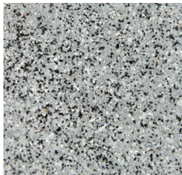
CQS-4702 | 0,3/0,8 mm Base* middle grey