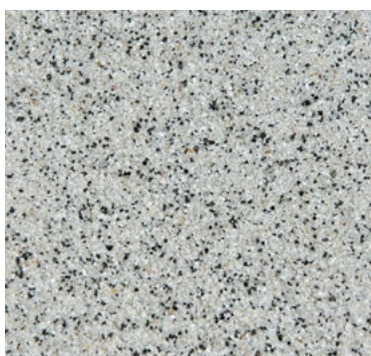
CQS-4602 | 0,3/0,8 mm Base* light grey CQS-4652 | 0,7/1,2 mm