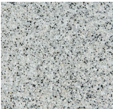
CQS-4701 AS | 0,3/0,8 mm Base* light grey

Colour stable antistatic sand mixtures for decorative broadcast RX flooring. Easy to use sand mixtures with controlled consumption, grindable for floorings with slip resistance levels R11 and R10.