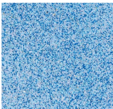
CQS-4608 | 0,3/0,8 mm Base* blue CQS-4658 | 0,7/1,2 mm

* Base: Colour of the base coat EP 99 or PU 424