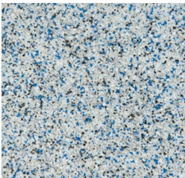
CQS-4703 | 0,3/0,8 mm Base* light grey