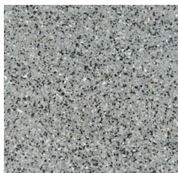
CQS-4603 | 0,3/0,8 mm Base* middle grey CQS-4653 | 0,7/1,2 mm