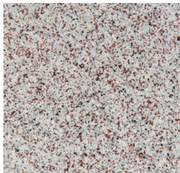
CQS-4704 | 0,3/0,8 mm Base* light grey

* Base: Colour of the base coat EP 99 EL+