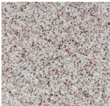
CQS-4704 | 0,3/0,8 mm Base* light grey