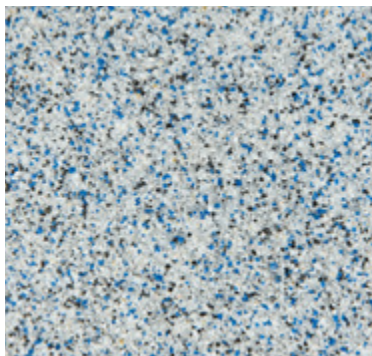
CQS-4703 | 0,3/0,8 mm Base* light grey